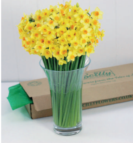
Pack D 50 flowers